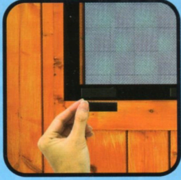
Match the side magnet to the closure's magnet