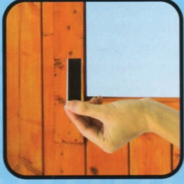
Stick the opposite side of the velcro on the top of the Frame