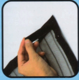
Stick the velcro on the top of the mesh